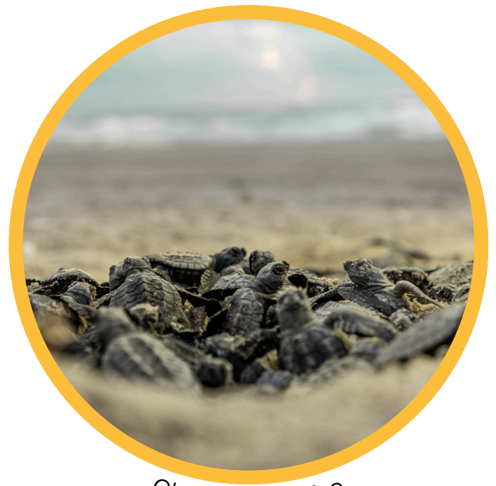
Gladys Porter Zoo

Sea Turtle SAFE focuses on two critically endangered populations: