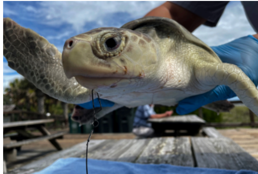
South Carolina Department of Natural Resources