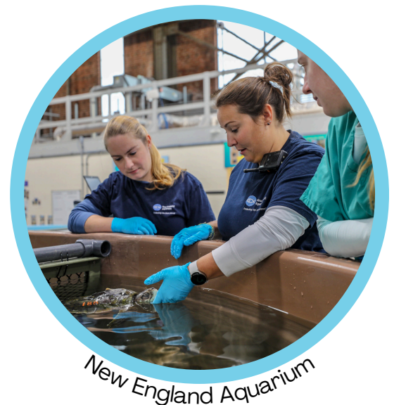
New England Aquarium

Interested in becoming a Sea Turtle SAFE Program Partner or Supporter? Reach out to Program Leader, Kelly Thorvalson: kthorvalson@scaquarium.org